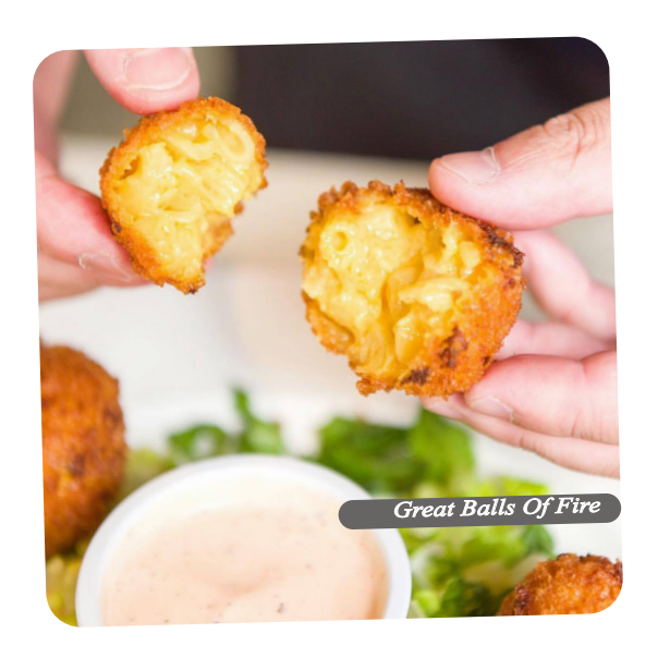
GREAT BALLS OF FIRE 13.95 crunchy mac-n-cheese & sriracha-ranch dip