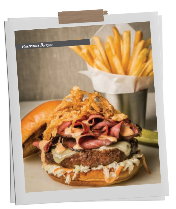
PASTRAMI BURGER 21.95 80z beef patty topped with pastrami, swiss, slaw Russian dressing, crispy onions & fries